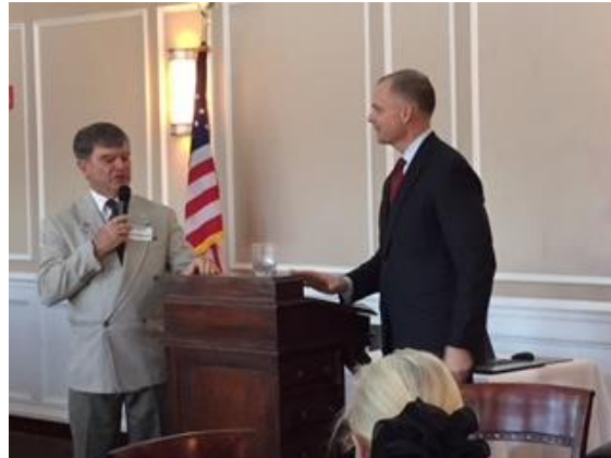
MOAA Glasses for our Speaker