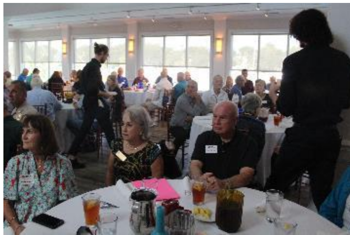
Capacity Crowd at our 10/3/23 Meeting