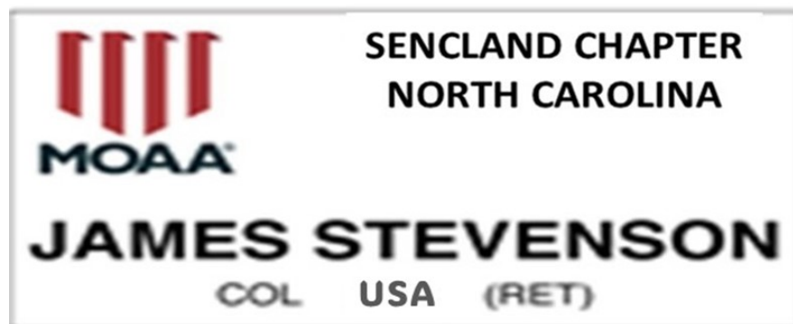
(Example of completed nametag)

When the nametags are received they will be available for pickup at Chapter luncheons or other events. If you have any questions, please contact Chris at villa_morin@hotmail.com or 703-798-1754 .