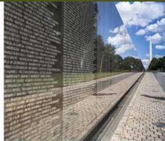
Vietnam Veterans Memorial, Washington, D.C.

In recognition of National Vietnam War Veterans Day this edition of the SENCLAND Sentinel features a display of some of the impressive Vietnam Veterans Memorials across the U.S.A.