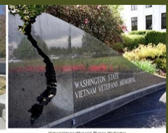
Vietnam Veterans Memorial, Olympia, Washington