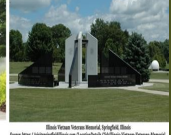
Illinois Vietnam Veterans Memorial, Springfield, Illinois