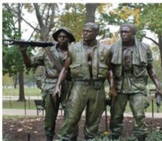
The Vietnam Memorial Three Servicemen Statue, Washington, D.C.