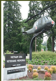
Vietnam Era Veterans' Memorial, Canby, Oregon

Source: https://www.go/nutrition-health-care/stories/veterans-day-march-30th-anniversary-of-vietnam-women-memorial/