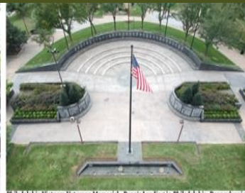
Philadelphia Vietnam Veterans Memorial, Penn's Landing in Philadelphia, Pennsylvania