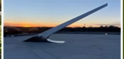
Kentucky Vietnam Veterans Memorial, Frankfort, KY

Source: https://en.wikipedia.org/wiki/Island_Northwest_Vietnam_Veterans_Memorial