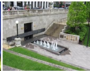
Vietnam Veterans Memorial, Chicago, IL