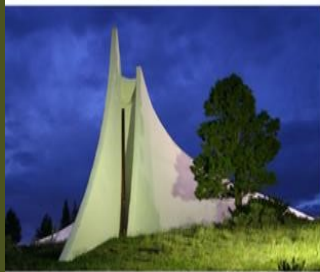
Vietnam Veterans Memorial, Angel Fire, New Mexico, USA