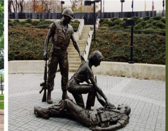
New Jersey Vietnam Veterans Memorial, Holmdel Township, New Jersey

Source: https://www.hmdb.org/m.asp?m=206091