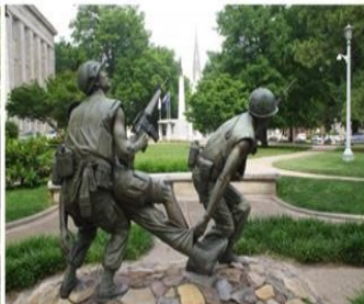
Vietnam Veterans' Memorial, Raleigh, NC