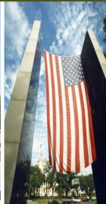
Florida Vietnam Memorial, Tallahassee, Florida