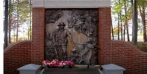
Faces of War Memorial, Roswell, Georgia

Source: https://en.wikipedia.org/wiki/Queens_Vietnam_Veterans_Memorial