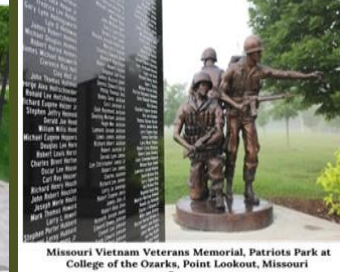
Missouri Vietnam Veterans Memorial, Patriots Park at College of the Ozarks, Point Lookout, Missouri