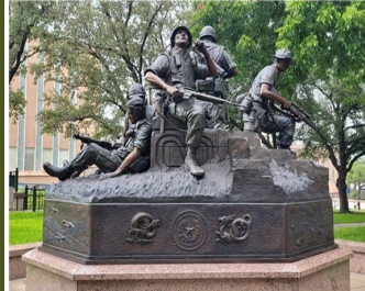
The Texas Capitol Vietnam Veterans Monument, Austin, Texas