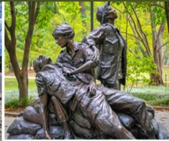
The Vietnam Women's Memorial, Washington, D.C.

Source: https://worldstrides.com/blog/2014/12/vietnam-veterans-memorial/