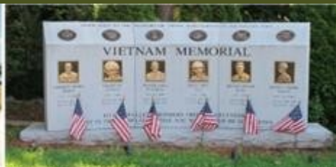
Vietnam War Memorial, Charlestown, MA, USA

Source: http://www.vietvet.org/bsprings.htm