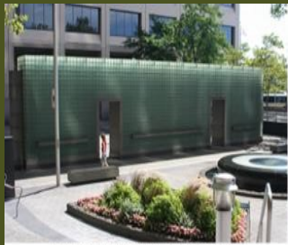
Vietnam Veterans Plaza, Manhattan, New York