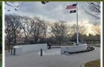
Queens Vietnam Veterans Memorial, Flushing Park in Flushing, Queens, New York City

Source: https://en.wikipedia.org/wiki/Charlestown_Vietnam_Veterans_Memorial