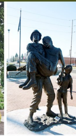
Georgia Vietnam Veterans Memorial, Atlanta, Georgia