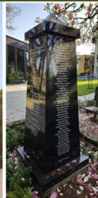
Vietnam War Memorial, Milwaukie, Oregon