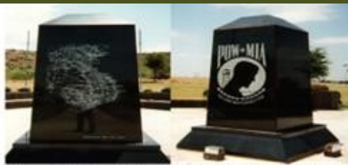
Vietnam Veterans Memorial, Big Springs, Texas

Source: https://visitnj.org/nj-attractions/new-jersey-vietnam-veterans-memorial-and-vietnam-era-museum-educational-center