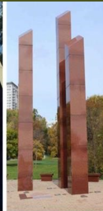
Vietnam Veterans Memorial at Veterans Park, Milwaukee, Wisconsin