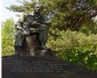
Island Northwest Vietnam Veterans Memorial, Spokane, Washington