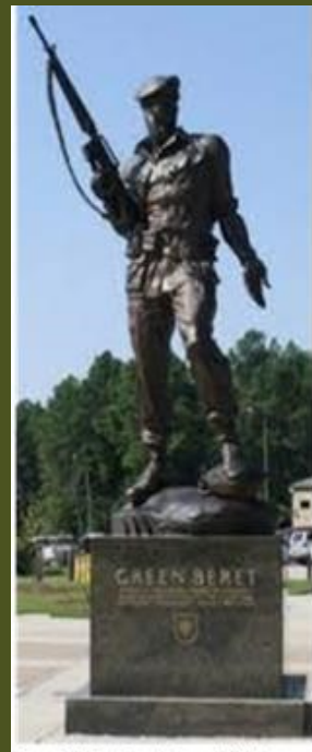
Special Warfare Memorial Statue, (Bronze Bruce) Plaza at Fort Liberty, North Carolina