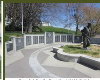
Vietnam, Cambodia, and Laos Veterans Memorial, Salt Lake City, Utah