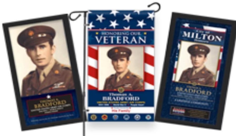
New Hanover County Veteran Banner Project

The New Hanover County Veterans Council is proud to announce the Veterans Tribute Banner Project. Family members, friends or businesses can sponsor customized banners honoring the service of their veterans, active-duty service members, or reservists. Banners will be displayed from utility poles in prominent locations in New Hanover County. To learn more about banner requirements, contact the Veteran Banner Project via email at bannersfor-vets@gmail.com , or visit https://www.sencveteransparade.com/home/veteran-banner-project/?fbclid=IwAR2J_JZXQnirWIBPg8Jy5GHpWy02LApfSwxLOANqcDvCaXEgazdwC0HH-sk