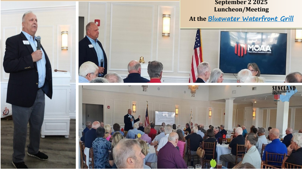
September 2 2025 Luncheon/Meeting At the Bluewater Waterfront Grill