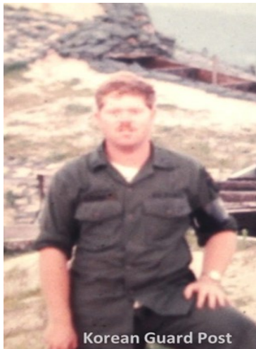
Korean Guard Post