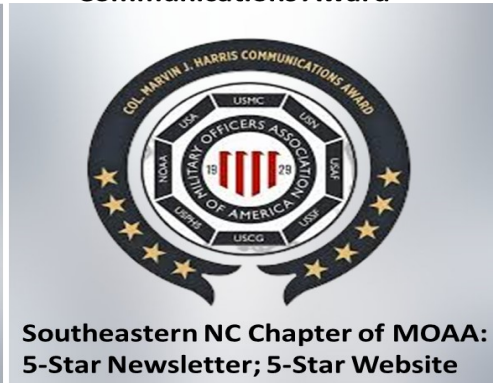
Southeastern NC Chapter of MOAA: 5-Star Newsletter; 5-Star Website

MOAA has announced the winners of the annual Council and Chapter Levels of Excellence (LOE) Awards and annual Col. Marvin J. Harris Communications Award for 2025. The SENCLAND Chapter has once again received the MOAA Levels of Excellence (LOE) Award and Harris Communications Award, both at the Five-Star Level for 2025. This represents the 7th consecutive year we have won the LOE at this level, and the 8th for the Harris Award at this level.